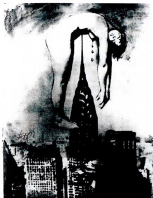
Anita Steckel: Pierced , early 1970s, photomontage, 48 by 36 inches; at Tabla Rasa .

is channeled through found-object assemblages such as Sunnyland (The Dark Side) , 1998, an old-fashioned washboard crowned by a cutout of a mammy doing laundry; below, on the corrugated grate, is a stenciled image of a lynched African-American man. Lezley Saar embraced the use of vintage materials with an autobiographic twist in her folk-art-style paintings on books and textiles. In the weathered-looking My Nature (1994), a supine female, a tree growing out of her chest, is depicted on a floral-patterned ground. One of Allison Saar's noted rough-hewn wooden carvings occupied the room's center: in Coup (2006), a nearly life-size female figure is seated, her hair braid stretching backward, blending with a cargo rope that winds around a pile of old suitcases and trunks. She holds a large scissors.