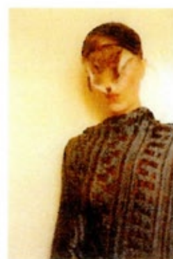
Above, Birgit Jürgenssen: Untitled (Self with Fur), 1977, color photograph, 5 by 3 1/4 inches; at Galerie Lelong, New York.