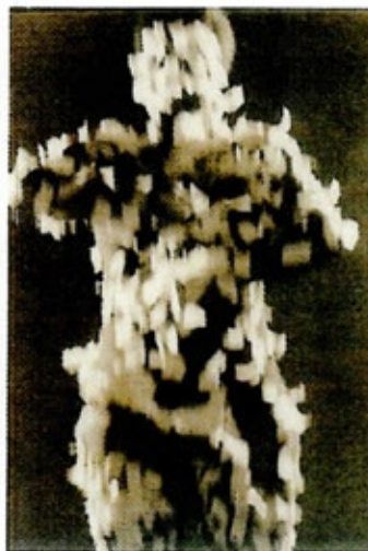
Left, Senga Nengudi: Masked Taping, ca. 1978/79, black-and-white photograph documenting private performance, paper 10 by 8 inches; at Galerie Lelong.