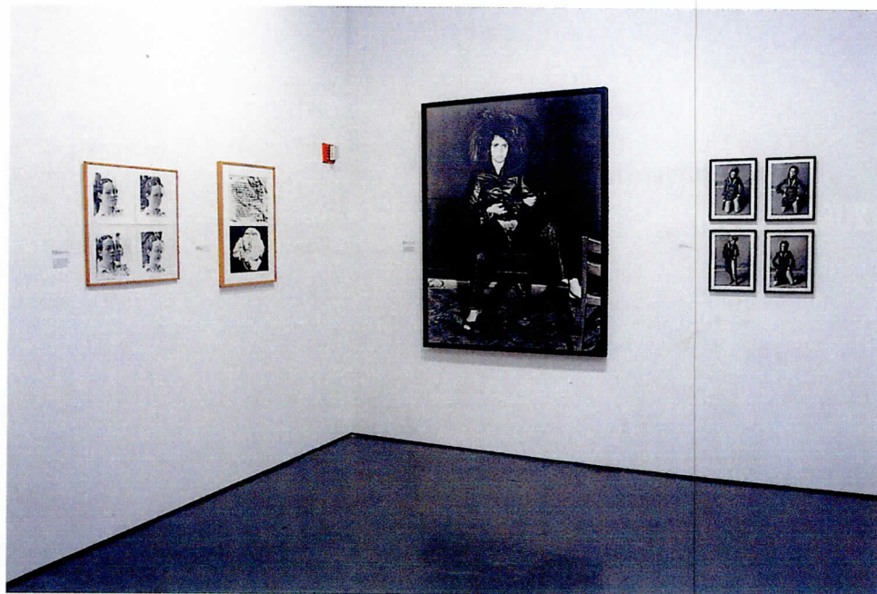
Photographs by Laurie Anderson (left), 1975 and 1977, and Valie Export (right), 1969/2001 and 1970. Works this page in "Gloria."