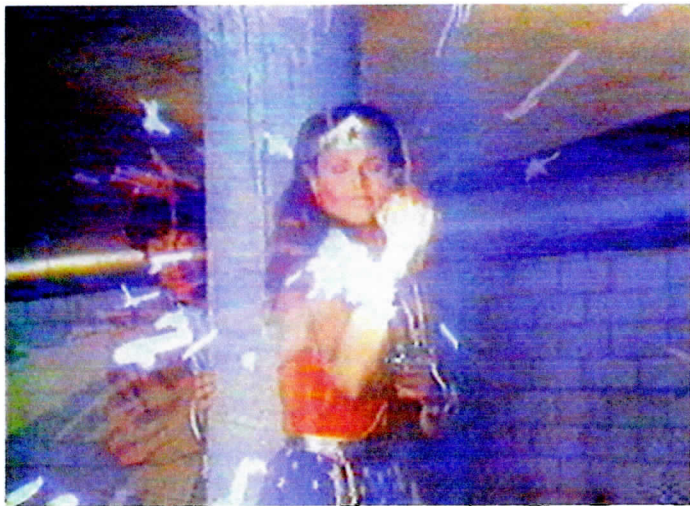
Still from Dara Birnbaum's Technology/Transformation: Wonder Woman , 1978, color video, 5 1/4 minutes. Works above and below in "Gloria" at White Columns, New York.