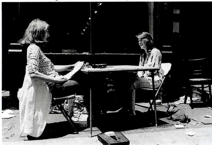
Mierle Laderman Ukeles (left) performing Art Interviews at A.I.R. Gallery , New York, from the "Maintenance Art Activity" series, 1973-74.

sly satires of objects of male desire in 1960s foreign films, the feminist subtext seems especially strong. Standing beside an unlit hearth at crotch level, she smokes dreamily. In another, foodstuffs tumble out of her spilled grocery bag. The confrontational approach of Jenny Holzer's "Inflammatory Essay" posters (1979-82), which were plastered, guerrillalike, on city walls ("Don't be polite to me. Don't try to make me feel nice. I'll cut the smile off your face . . .") suggests a different reading for her "Truisms," not mimicry of the neutral tone of authority.