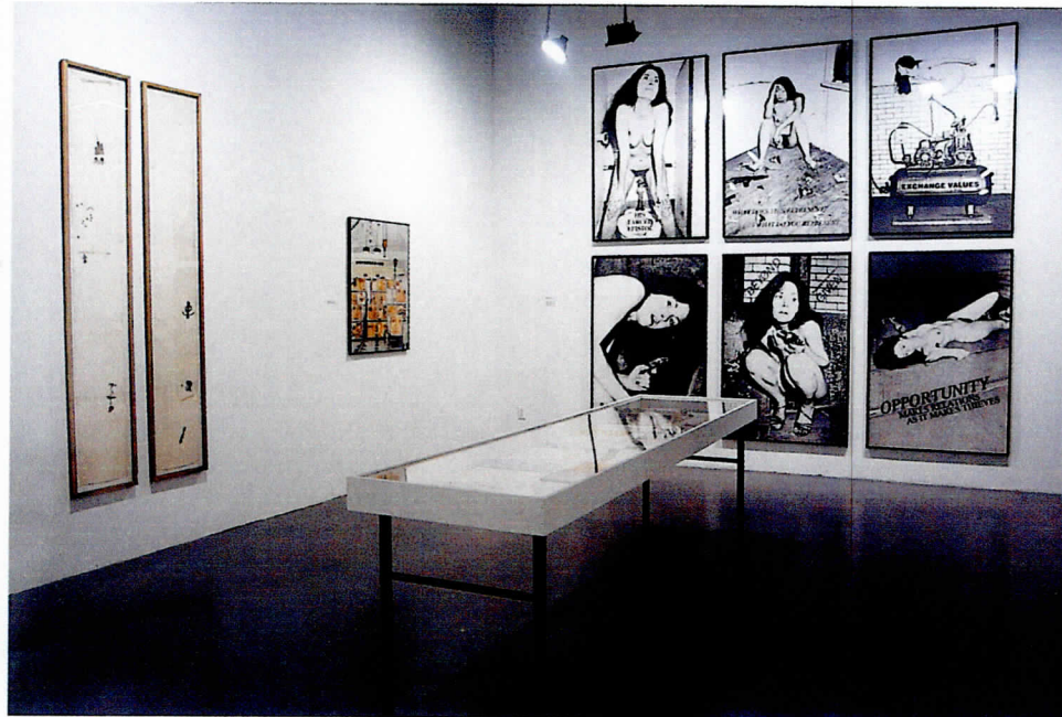
Left to right, Nancy Spero's collages Codex Artaud XXVIII A and B, 1972, Martha Rosler's photomontage Cargo Cult, ca. 1972, Hannah Wilke's photo series So Help Me Hannah, 1978; in vitrine, 1970s archival materials.