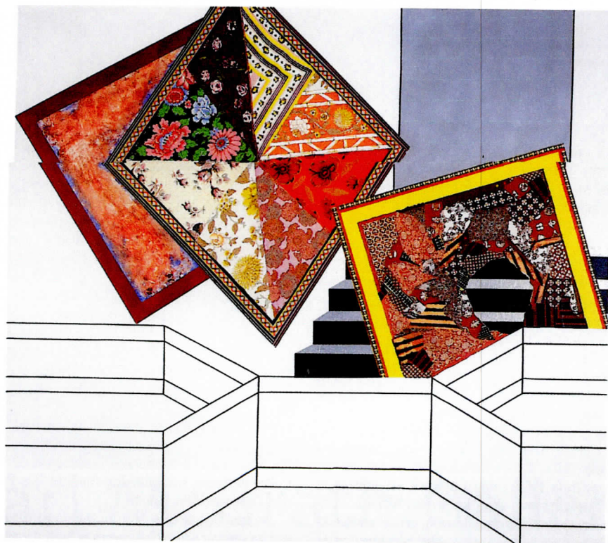
Miriam Schapiro: Lady Gengi's Maze , 1972, mixed mediums, 72 by 88 inches. Works this spread in "Personal & Political."