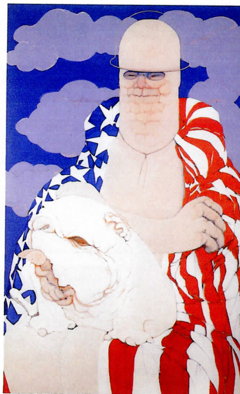
May Stevens: Top Man, 1975, acrylic on canvas, 60 by 40 inches.

In the entry to White Columns's quietly brilliant, lighthearted "Gloria" was a monitor playing vintage video featuring Linda Carter undergoing a "swirl" that transforms her again and again from a workaday female to a tiara-bedecked, sequin-clad superhuman. Dara Birnbaum's Technology/Transformation: Wonder Woman (1978), a loop edited from TV clips, wistfully spoofs the aspiration at the heart of Women's Lib to unleash the inner